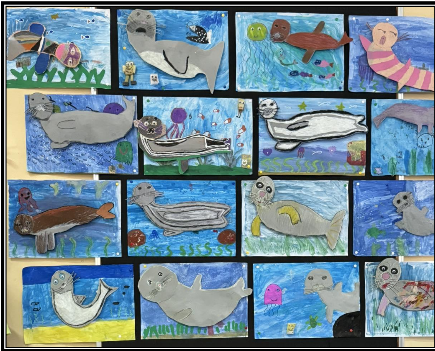
Monachus Seal (Children's Artwork)