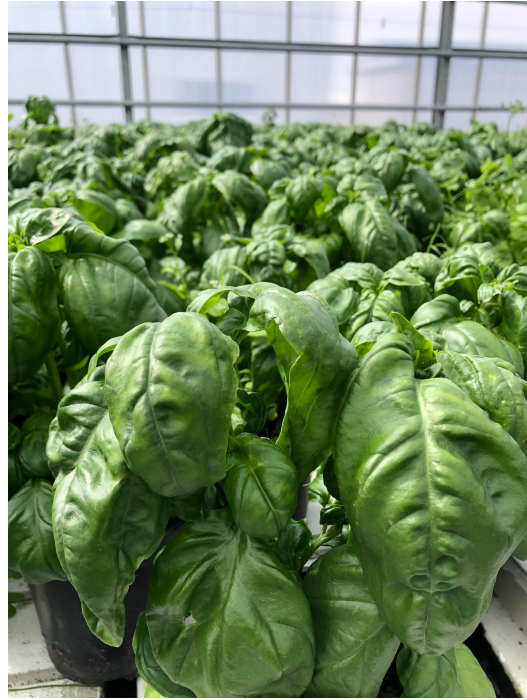
Parsley and basilica plants.