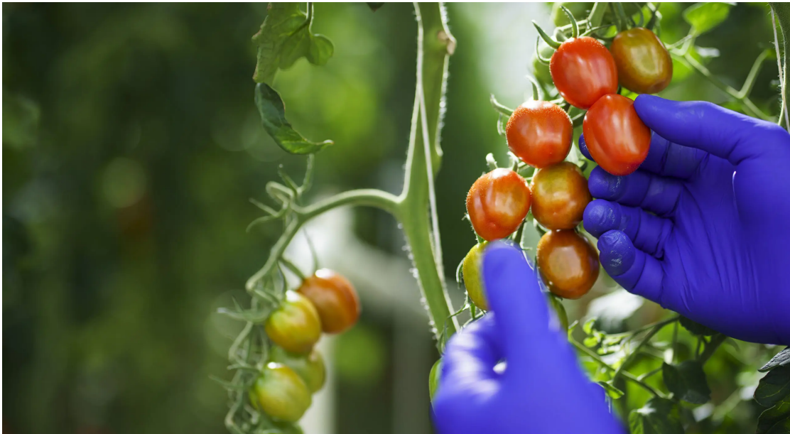
They are famous for their sweet cherry tomatoes.