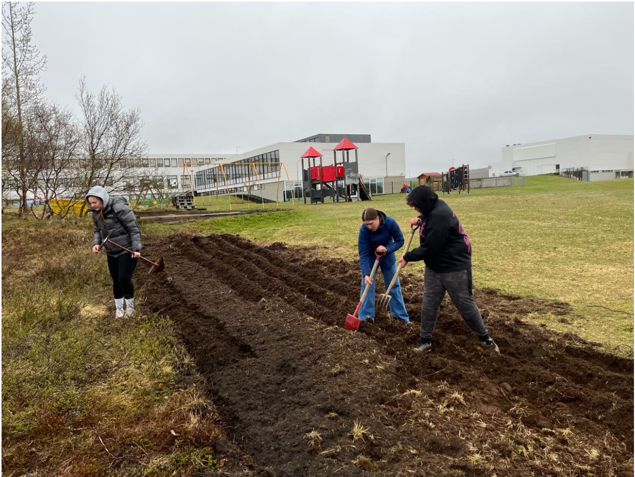
Part of the oldest student making the potato garden ready for the planting.