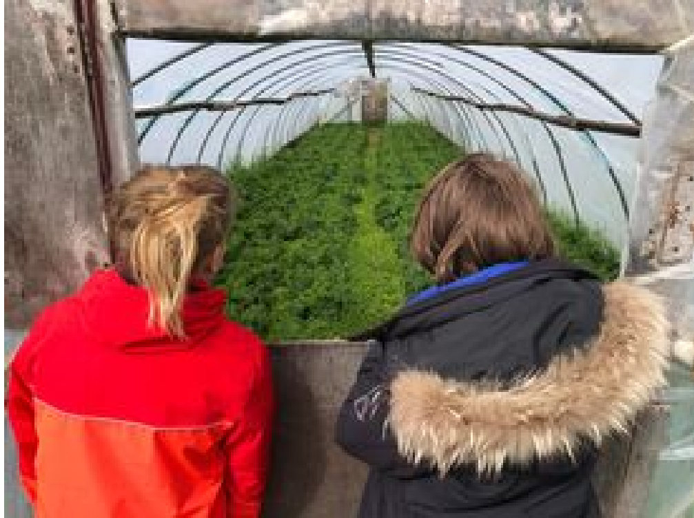
Two students looking at the kale.