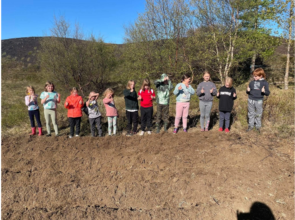
Part of the youngest student after planting the potatoes.