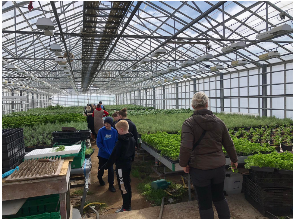
The herbs house, here they grow basilica, rosemary, thyme and parsley.